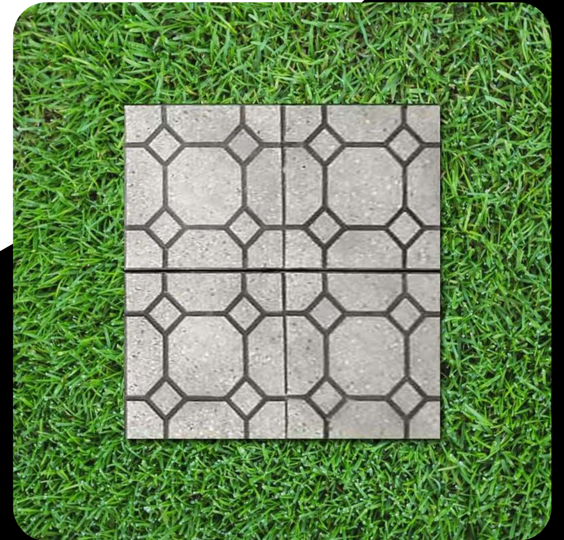
Article No : T-103