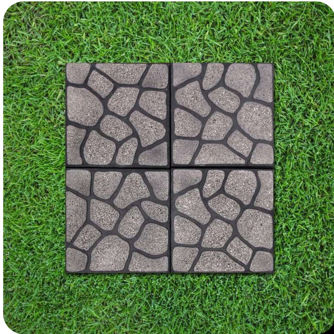
Article No: T-101