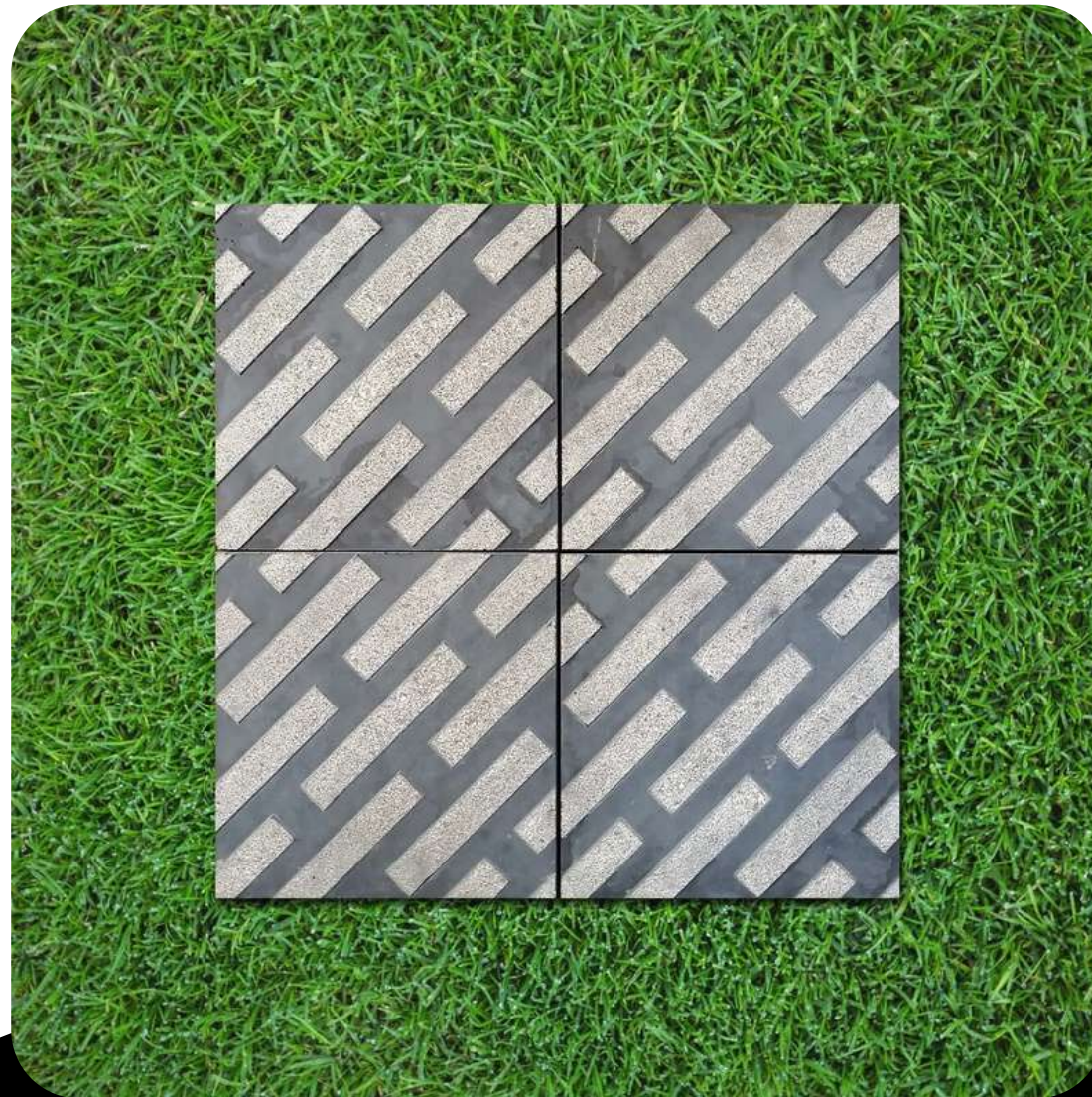
Article No : T-102